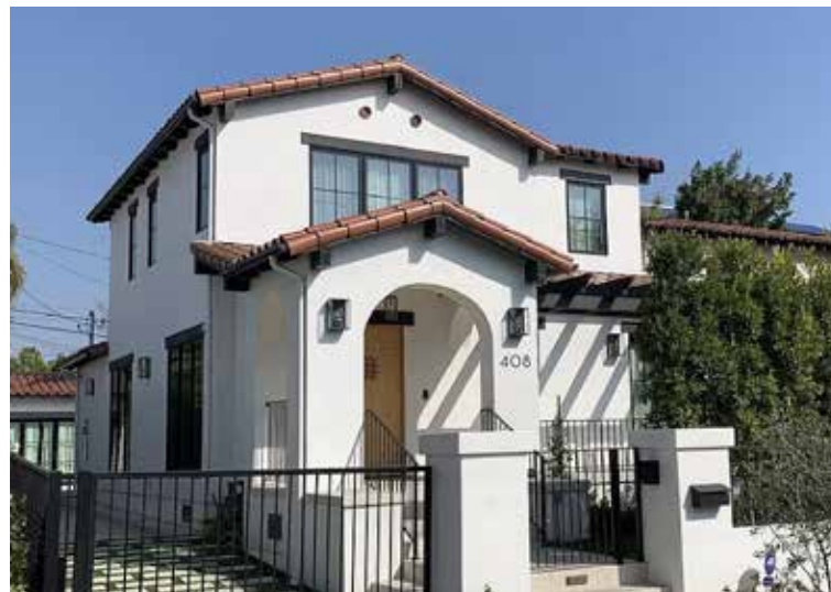
408 Westbourne Dr | West Hollywood