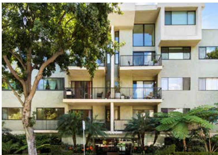
9000 Cynthia #302 | West Hollywood