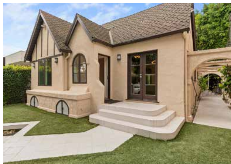
559 Huntley Dr | West Hollywood