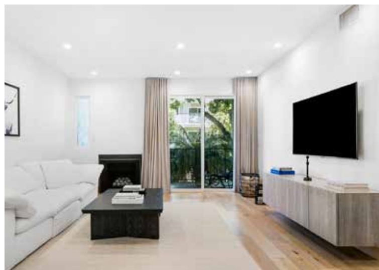
9000 Cynthia #207 | West Hollywood