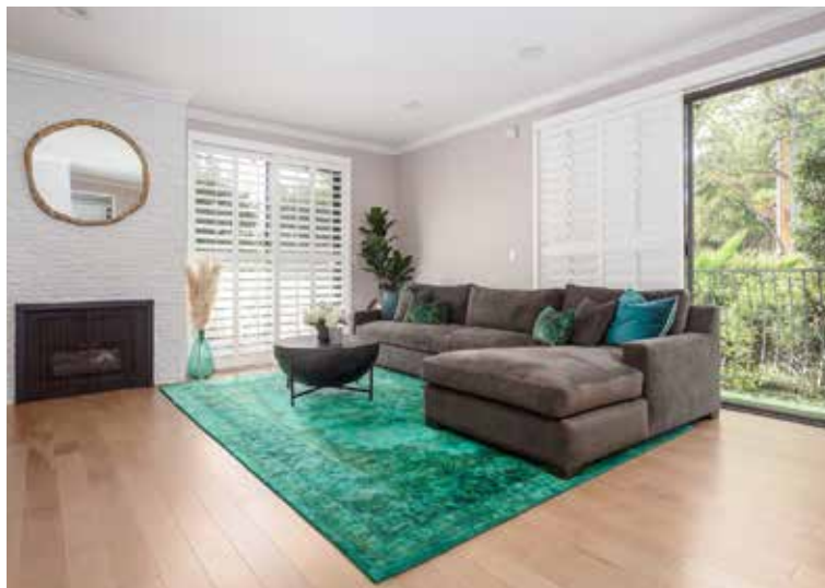
9125 Charleville #19 | Beverly Hills