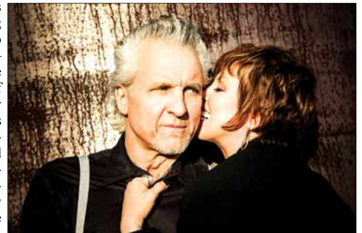
Neil Giraldo and Pat Benatar