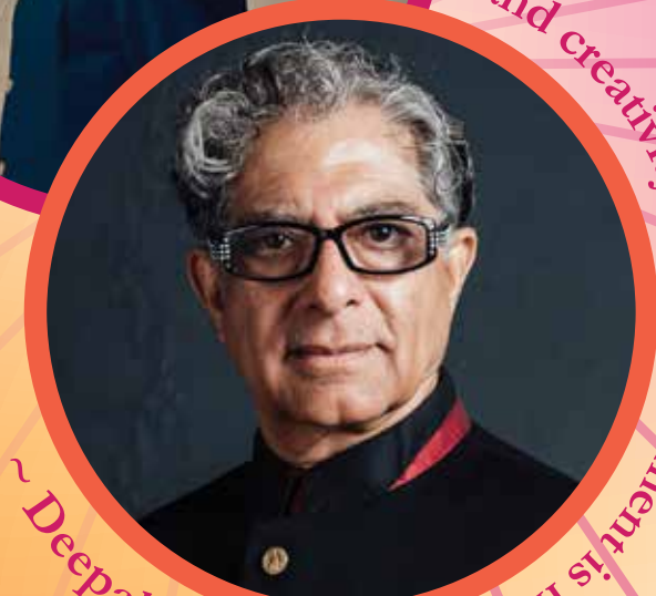
~ Deepak Chopra

“...and creativity and the moment is now.”