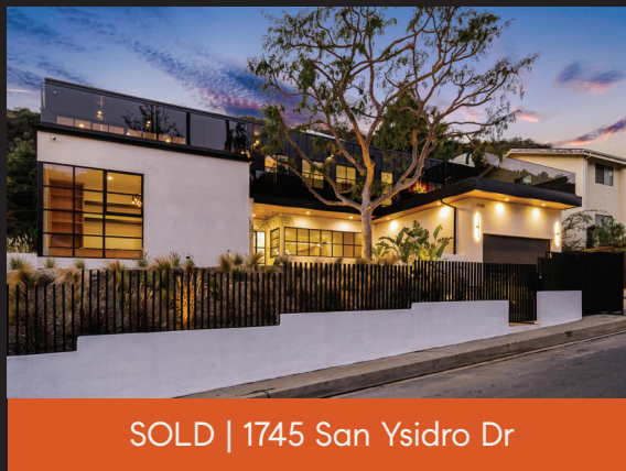
SOLD | 1745 San Ysidro Dr