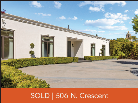
SOLD | 506 N. Crescent