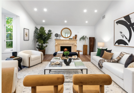
JUST LISTED | 10588 Lindbrook Dr