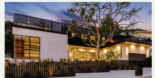
SOLD | 1745 San Ysidro Dr