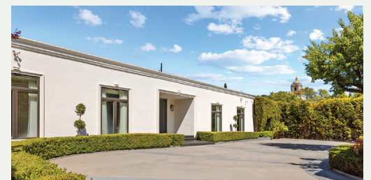
SOLD | 506 N. Crescent