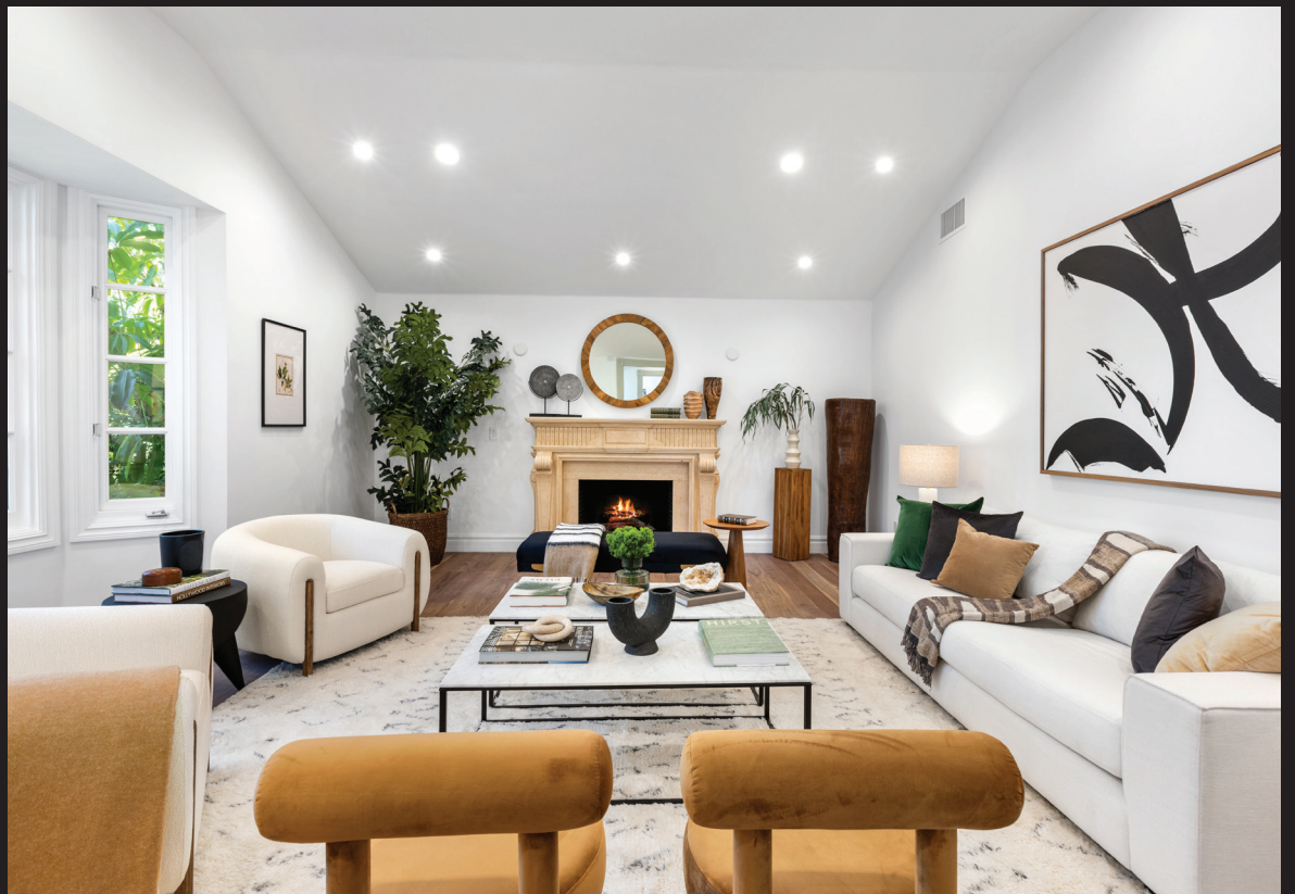
JUST LISTED | 10588 Lindbrook Dr