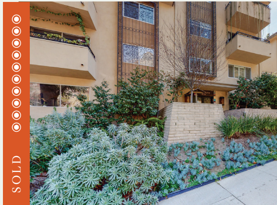
6728 HILLPARK | HOLLYWOOD HILLS Listed at $459,000 | Sold for $495,000 On the market for 129 days with previous broker