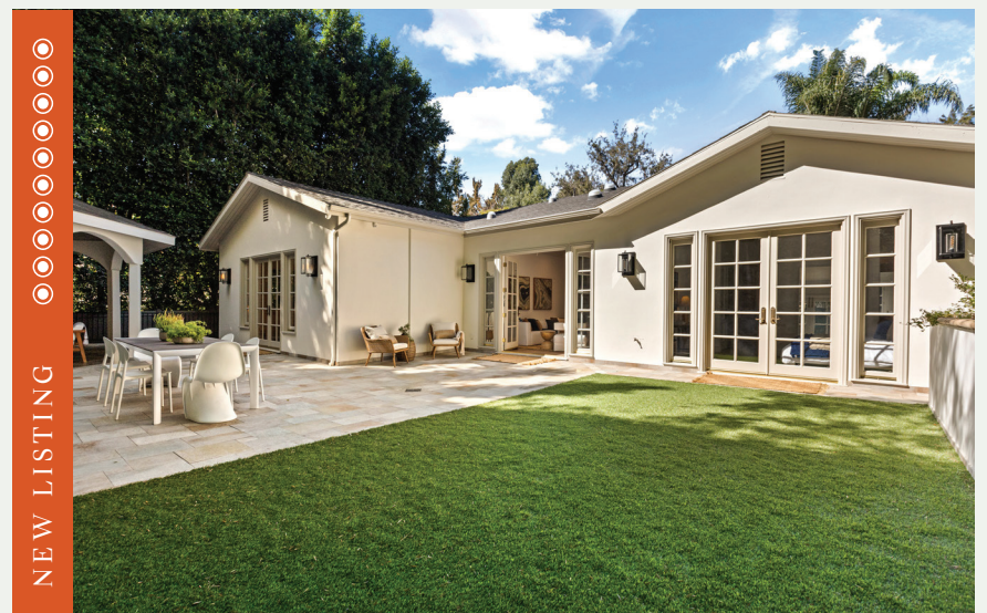
10588 LINDBROOK AVENUE | WESTWOOD Listed at $3,895,000

WANT A PROFESSIONAL EVALUATION OF YOUR PROPERTY? REACH OUT TO ME! NO COST, NO OBLIGATION.