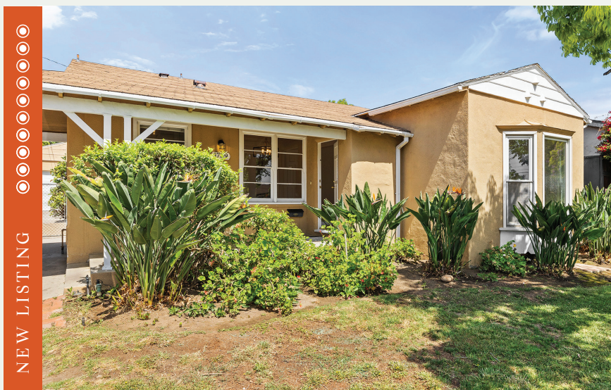
1739 PREUSS | BEVERLYWOOD Listed at $1,895,000