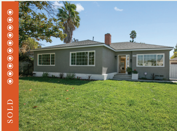
12420 ALBERS | VALLEY VILLAGE Listed at $998,000 | Sold for $1,051,000 On the market for 5 months with previous broker