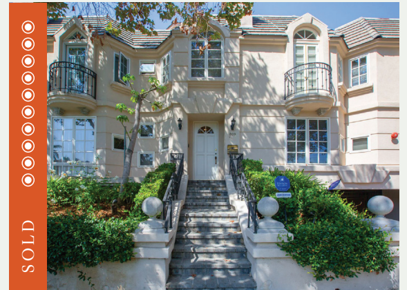
309 ALMONT | BEVERLY HILLS Listed at $1,249,000 | Sold for $1,425,000