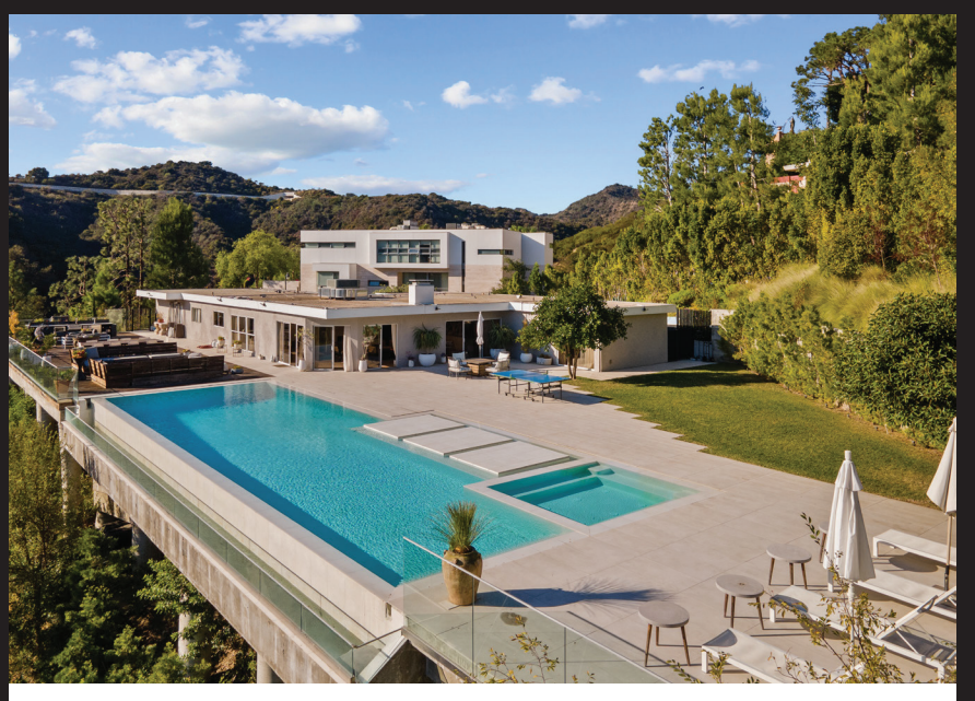
1650 Clear View, Beverly Hills