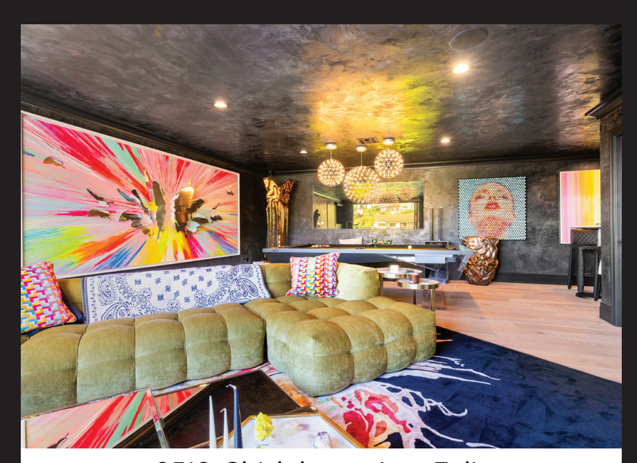
2519 Chislehurst, Los Feliz