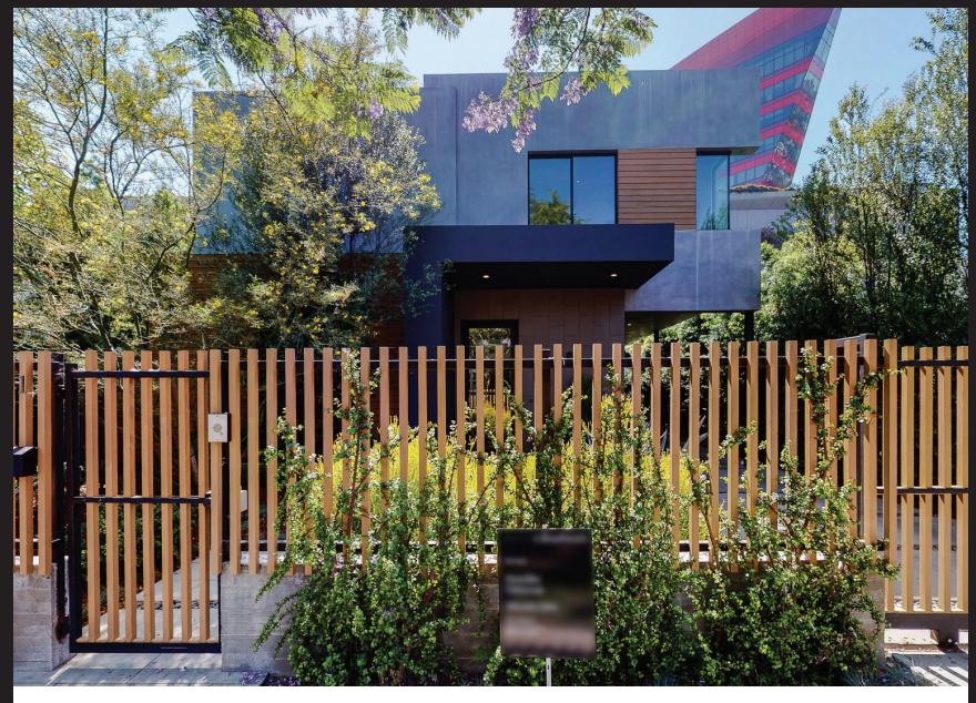
701 Huntley, West Hollywood