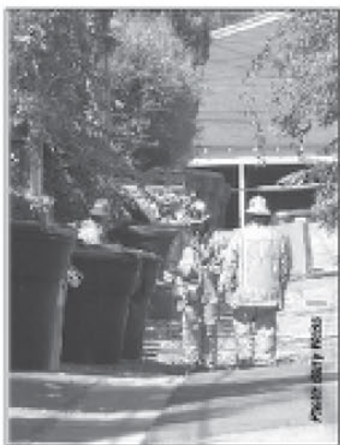
Beverly Hills firefighters investigate a ruptured gas line in the alley between the 400 South blocks of Camden and Peck Drives.

In Los Angeles County as a whole, sales of single-family residences are up 4.4% to a median price of $548,000, and condominium prices are up 1.7% to a median price of $410,000 since August 2005.