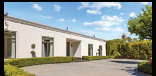
SOLD | 506 N. Crescent