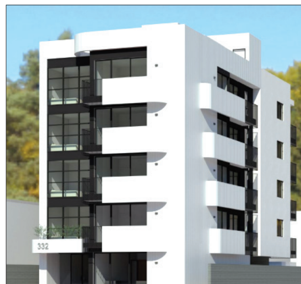
Rendition of Project

During the meeting, the Commission requested staff to start with the styrofoam prohibition first and at a later time intro-