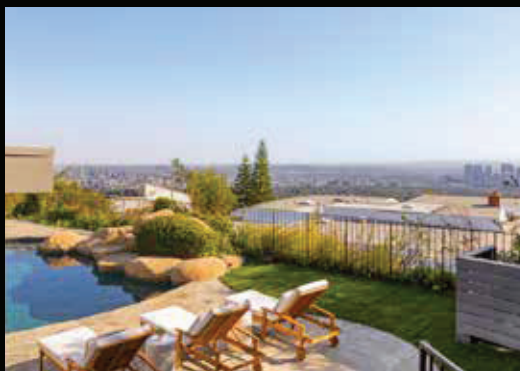
JUST LISTED | 1449 Laurel Way