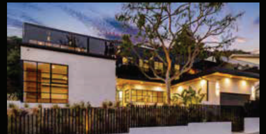
SOLD | 1745 San Ysidro Dr