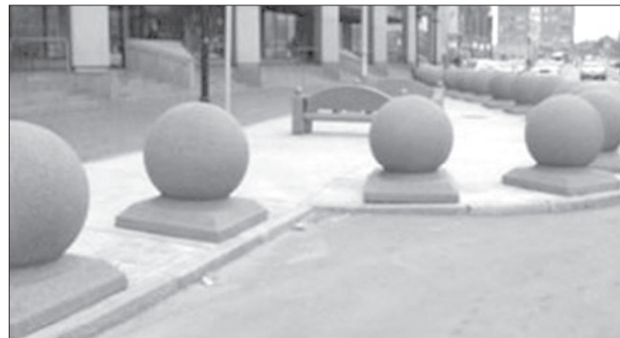
Proposed K-Rail Design

moved at the request of the Rodeo Drive business and property owners; however the sidewalk security barriers still remain today. The barriers have been a recurring discussion for both property and business