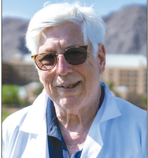
Mayor Julian Gold

Adjudicated as a newspaper of general circulation for the County of Los Angeles. Case # BS065841 of the Los Angeles Superior Court, or November 30, 2000.