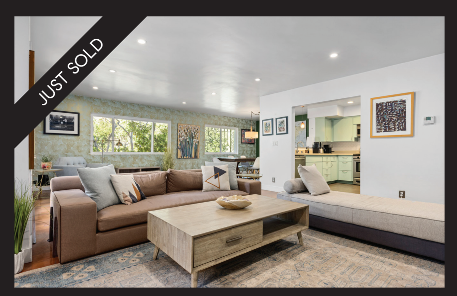
6744 Hillpark #305, Hollywood Hills