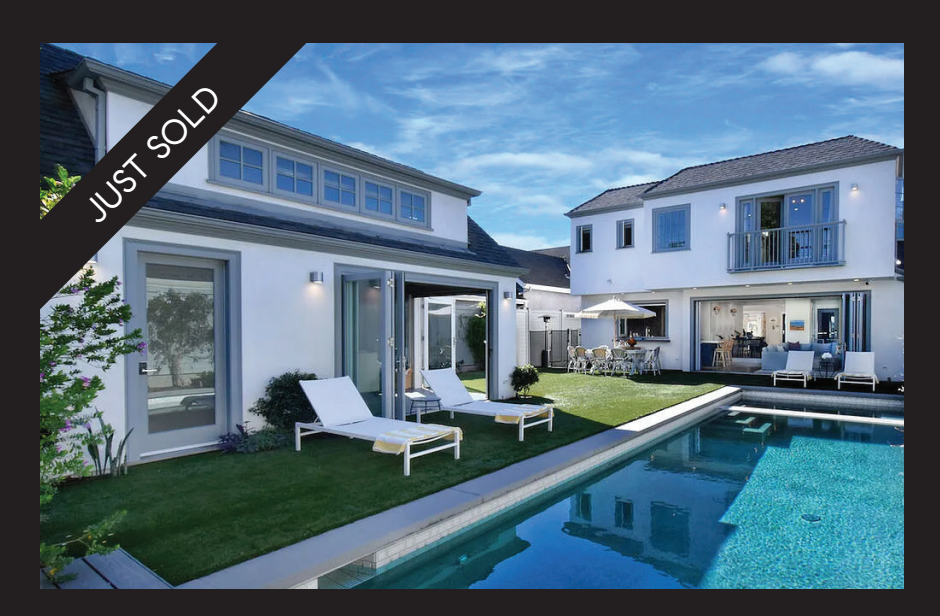
132 S Lucerne, Hancock Park