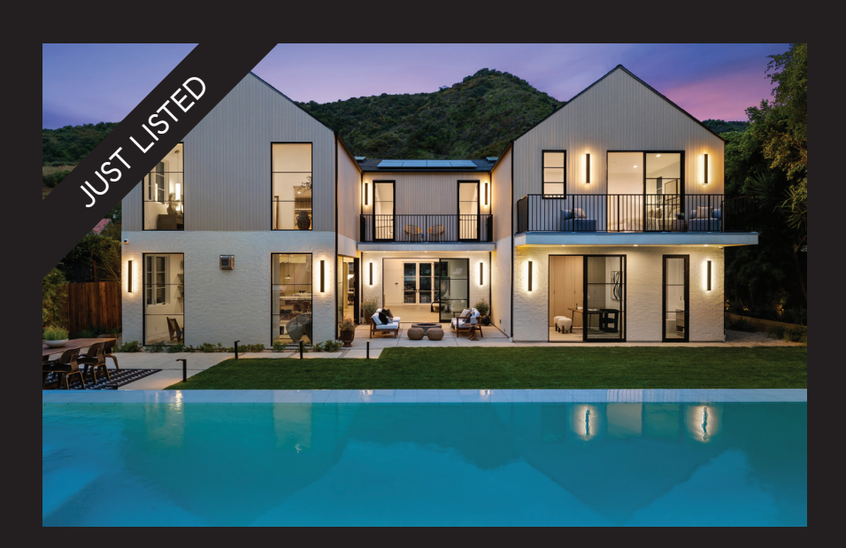
2100 San Ysidro, Beverly Hills