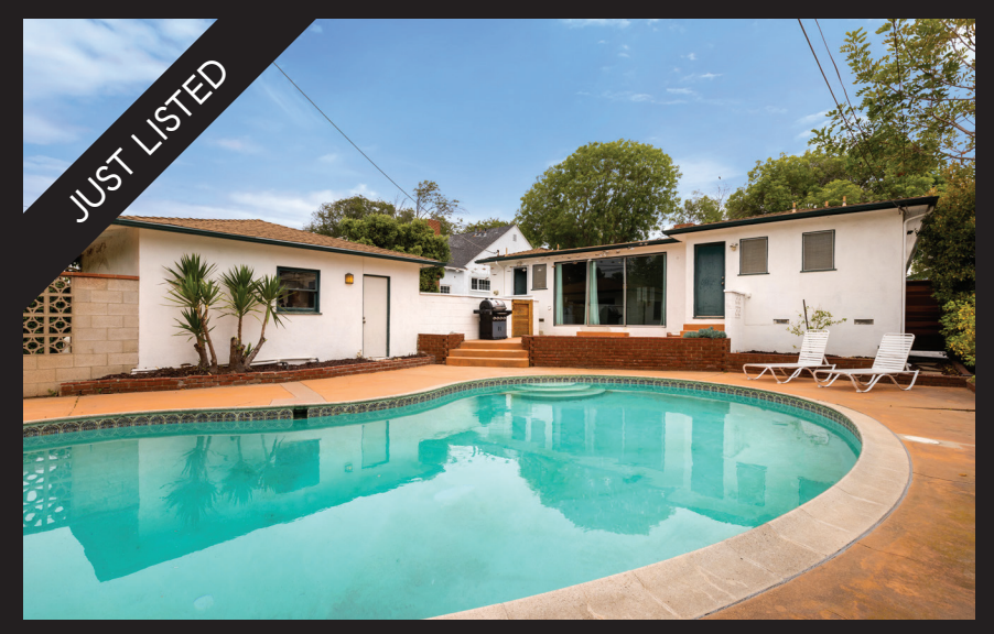
7901 Beland Ave, Westchester