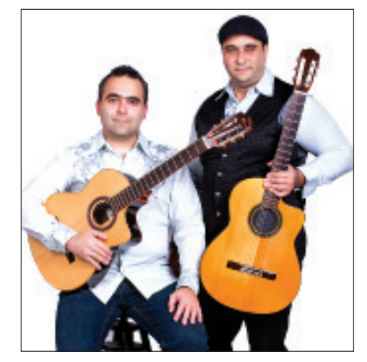
briefs cont. on page 8

Rumba Acoustic will be performing tonight as part of Concert on Canon.