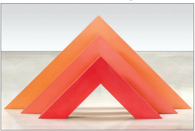
"Trinity" by Judy Chicago

The selected location was expected to be at the Northwest corner of Crescent Drive and South Santa Monica Boulevard adja-