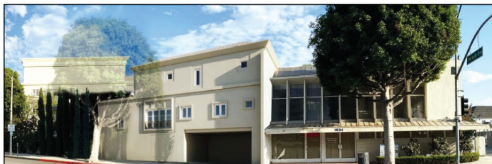
Proposed Project Addition (No Trees to be Removed)

isting outdoor patio to Villa alongside South Santa Monica Boulevard to add an additional bedroom and dining room area. The new addition would not add any additional height or hotel rooms. The improvements would include a new staircase from the first and second levels, layout changes to the first floor, and the addition of a fourth bedroom on the second floor.