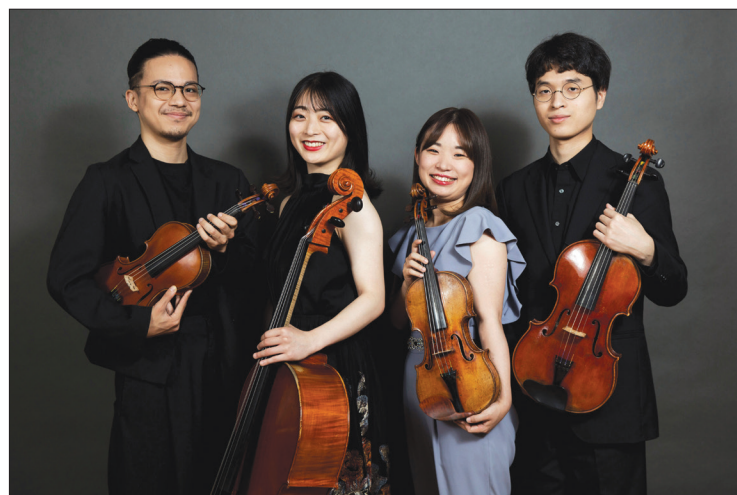
Colburn 1 - Quartet Integra

considered the quintessential chamber ensemble, on Sunday, Aug. 27, 2023, at 3 pm, at Zipper Hall in Downtown Los Angeles.