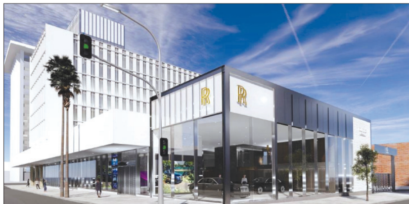
Proposed Project for 9460 Wilshire Blvd.

The Planning Commission is expected to discuss a Conditional Use Permit for the establishment of a Rolls Royce