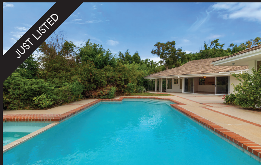
430 Doheny Rd