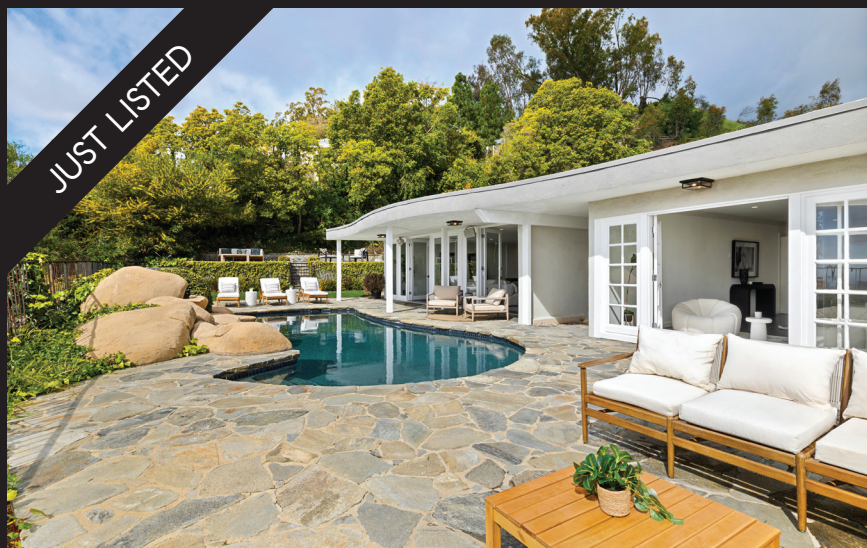
1449 Laurel Way, Beverly Hills