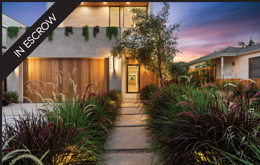
1645 Wellesley Ave, West LA