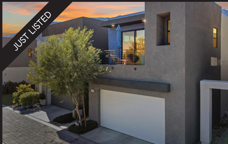
2703 Paragon Loop, Palm Springs