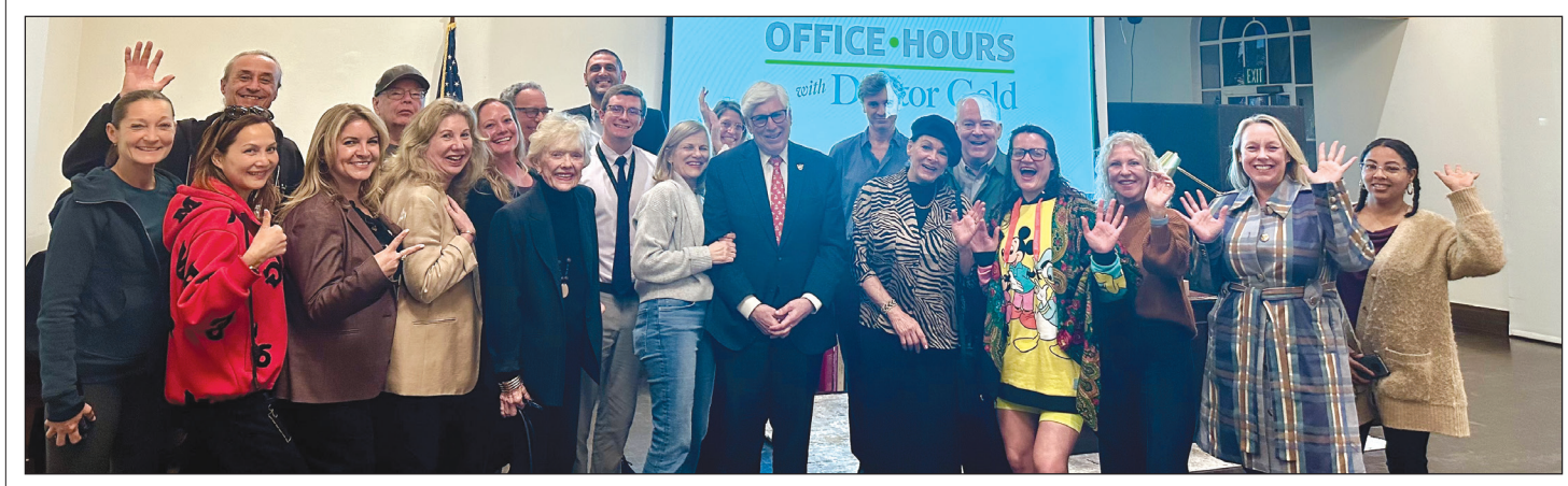
Mayor Holds Final "Office Hours with Doctor Gold"

The project includes the demolition of the existing vacant commercial building and the construction with ground floor